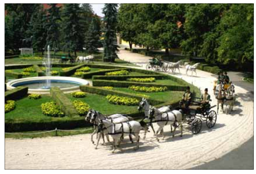
Babolna National Stud Farm, Hungary

mile endurance trek in 10 days which included sprints. Here they were evaluated on speed, jumping ability, trainability, disposition, and feed efficiency. Mares were raced and driven 5 in hand. Meticulous records were kept on each stallion - their size. characteristics, offspring, breedstamina, agility, hardiness and soundness. New stallions were bred to 30 mares a year for 3 years - 10 low quality, 10 average quality, and 10 high grade mares. At the end of the 3 years, all offspring were brought in front of a