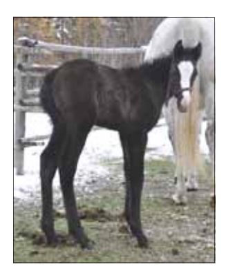
RAAs Dahmu (*Murad x *Dahri) October 2009 Grey filly. Very large foal. Taller than her full sister (RAA's Dumah) was at the same age. Available after weaning.