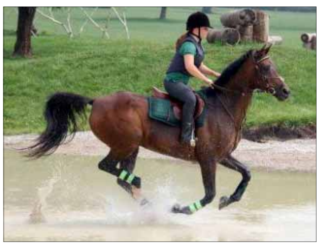
Echozalla (*Oman x Dolly's Echo ox) Purebred Shagya Arabian eventing mare.

Besides mounts for the military, Shagyas were bred to improve the breeding stock of the local Hungarian farmers as well as for other warmblood and pony breeds. Today, Shagyas can be found in the pedigrees of most Warmblood breeds - Westphalian, RPSI, Oldenburg, Trakehner, DWB, Holsteiner, German Riding ponies and many others. In the mid 80's, the Shagya stallion Amor was chosen very influential and athletic by the Lipizzaner stud farm in Piber, Austria to add refinement to the Lipizzaner breed. Here in