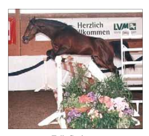
Taib Gazlan (Tibor (Elite Stallion) x Nadine) 2003 Taib Gazlan completed his HLP (Performance Test) with very high scores, including a 10 out of 10 for character. 2004 Reserve Champions of 6 to 10-year old stallions at Neustadt Dosse (Germany).

More pictures and video available on request 613-395-9054. Shannon McCracken