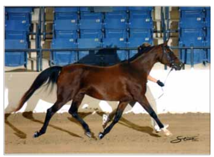
Wineglass Fleurie 2009 Top Ten AHA Sport Horse Nationals Mare HA/AA. Also 2009 AHA Region 11 Reserve Champion Sport Horse Mare HA/AA