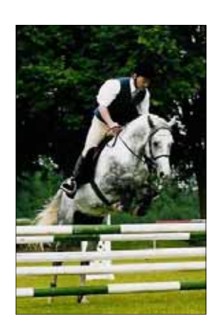
*MURAD (Shaman x Moldau)

Imported Purebred Shagya Arabian ISG Registry Stallion Winner of his Performance Test and Stallion Licensing in Germany. Linebred to Gazal VII & O'Bajan I-10.