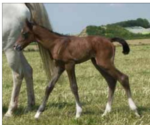
Olivero as a young foal.

More pictures and video available on request 613-395-9054. Shannon McCracken