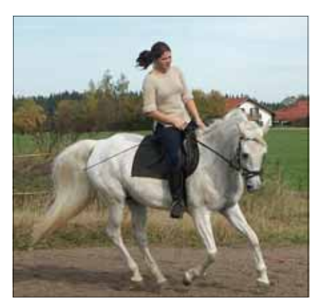
Obeya (Navarra x Oya)

Very balanced, natural collection with great movement at all three gates. Elastic back. Very kind. Good for farrier and vet. Started under saddle.