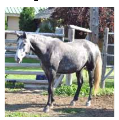
RAAs Dumah (*Murad x *Dahri) Grey 2006 mare. Her imported dam is by D'Artagnan (by Navarra) out of . Natascha-2 (El Nandu x Corina). Very flashy Lady. Will be the same size as her dam (156 cm); Very good all around horse, will bond close to her owner; will turn out to the heavier type of Shagya. Ready to get under saddle!