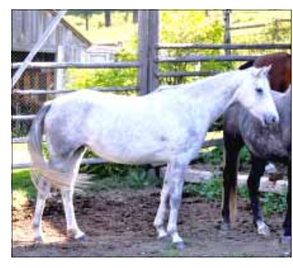
RAAs Marah (*Murad x *Pashera) Grey 2006 mare. Her imported dam is by Octavian (by Shagal) out of our imported mare *Philomena (Jeremias x Pythia). She will look like her mom later; very smart and cool young Lady; good with Farrier, very nice gaits (like her mom). Very good balance for her age. Will be same size or taller than her mom (154 cm). Ready to get under saddle!

We are offering the following Purebred Shagya Arabian *Murad daughters for Sale: