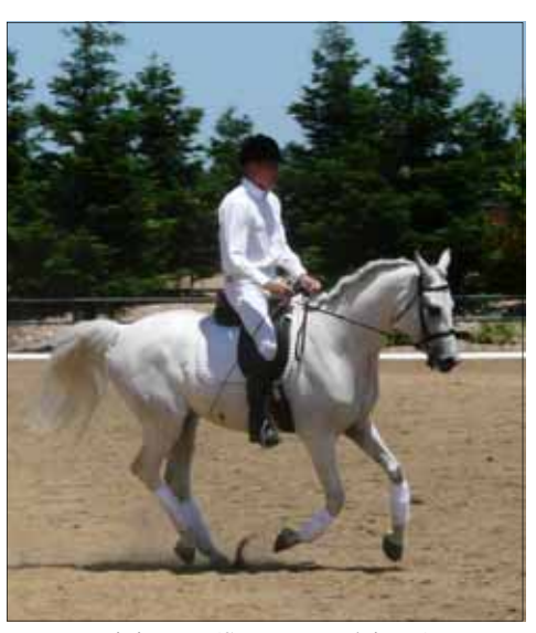
Ninja PFF (Sarvar x Nadeja ox) Part-Shagya Arabian dressage gelding.

Bacchus Z, Baldini I, Baldini II, Bricscar, and Boritas. Ahorn pony who competed at top levels of international jumping was also linebred to Bajar. Askar AA, Milton, Ramiro Z, and the eventer Jagermeister from the New Zealand Olympic team are some of the many other warmbloods