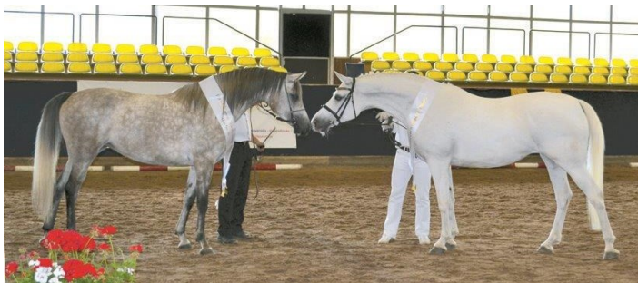
L to R: Champion Filly Shagya VI-1 [Shagya VI x 253 Kemir v] and Champion Mare Tigra [Ramiro x Tifla], Marbach 2013

pionship in Marbach 2013 with his daughter, Shagya VI-1 awarded Reserve Champion mare.