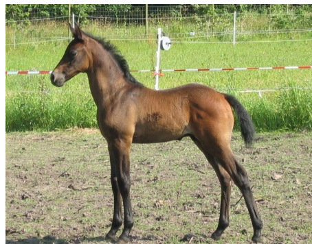
Above: Djacar [Daru x Carmen] at one month of age in 2004. Below Djacar in 2005 & Epona [Bonjor Bajar x Sobo's Tara]