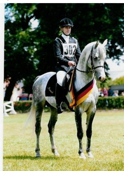
Shagya Stallion Murad