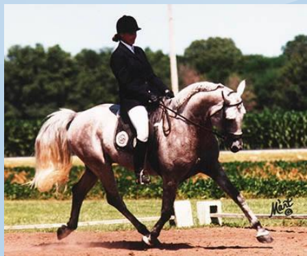
Budapest bred by Ulla Nyegaard