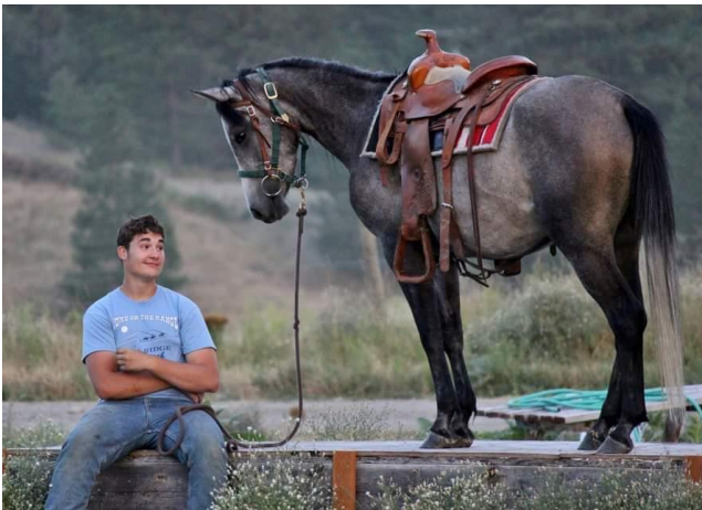
September Photo Contest Heirtothe Backwoods

2021 IS OFF TO A GOOD START AND WE HOPE ALL OF YOU ARE OUT THERE RIDING AND ENJOYING YOUR SHAGYA-ARABIANS.