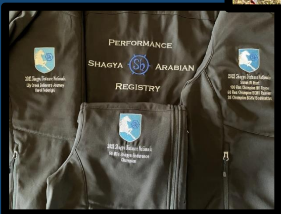
Lily Creek Believers Journey