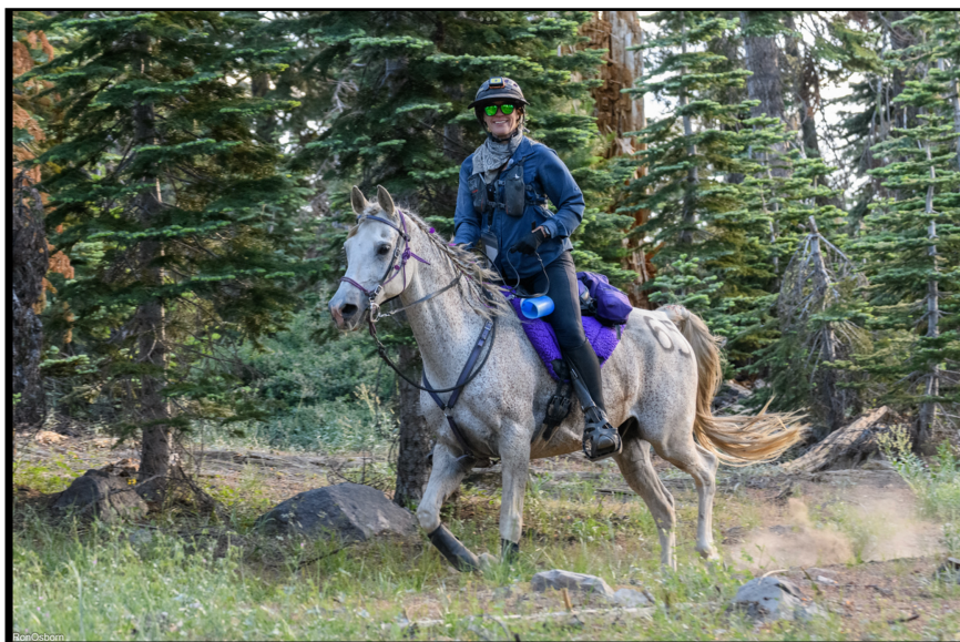
Photo location: Red Star Ridge, Tevis Trail